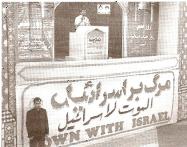
President Mahmoud Ahmadinejad lectures above a sign saying "Death to Israel" in Persian and Arabic, not "Down with Israel" as in the English translation below. Ahmadinejad has also declared in Persian that Iran will "wipe Israel off the map." University of Michigan's Juan Cole argued that the phrase was a mistranslation and that Ahmadinejad did not have genocidal intent.

ouffrage, or calibrate their agendas. 26 This may explain why the frequency and intensity of the hate language and incitement abated after the U.N. Security Council resolutions, even if the personalities holding office in the Iranian government remained constant.